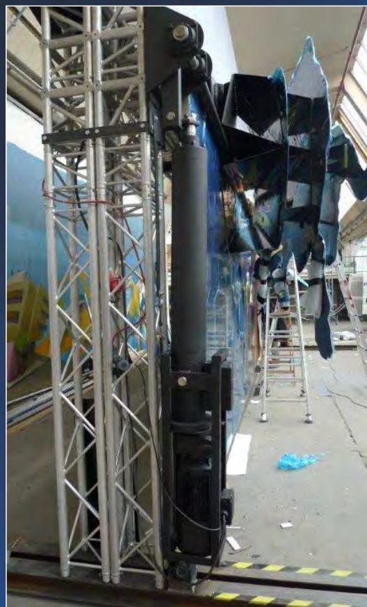
RACO electric actuator for opening up the gate